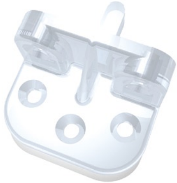
Not actual size. 1/4" Spacer Shown.