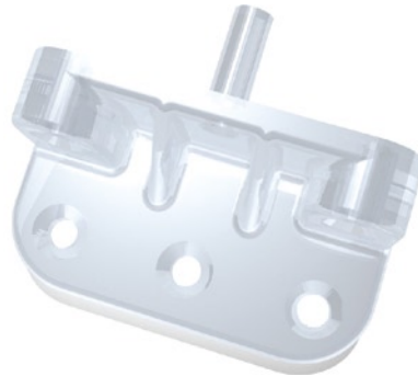
Not actual size. 1/4" Spacer Shown.