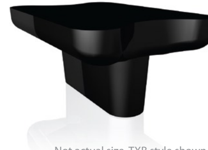
Not actual size. TXB style shown..